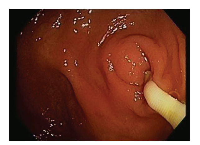
Figure 2. A segmented tapeworm.

The colonoscopic images revealed a segmented tapeworm showing contractile motility, approximately 12 cm long, 6 mm wide, attached inside the appendix. Mature D. latum can reach a maximum length of up to 25 m [1] consisting of a large number of segments called proglottids which are rectangular in shape, 3 - 5 mm long and 9 - 12 mm wide. D. latum infection can be caused by the ingestion of raw and undercooked fish. Humans are the main definitive host for D. latum. Most infected cases are asymptomatic, and about 40% may have vitamin B12 deficiency, but only 2% progress to anemia [8]. Prolonged D. latum infection usually causes vitamin B12 deficiency and megaloblastic anemia by parasite-mediated dissociation of the vitamin B12-intrinsic factor complex in the gut lumen making B12 unavailable to the host [9]. This can cause neurological damage to the host including central nervous system degenerative and peripheral neuropathy. Adult tapeworms are easily treated with praziquantel. A single dose of 25 mg/kg is highly effective against D. latum infection in humans [10]. The best prophylaxis is to avoid the consumption of raw or undercooked fish. It is uncommon of D. latum infection in humans, to present with chronic abdominal pain with iron deficiency anemia, especially in a non-endemic area as in this case. Physicians should be aware of this uncommon presentation, and