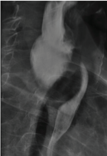
Figure 2. Esophagogram exhibiting extrinsic esophageal obstruction caused by the diverticulum.

tric junction. The CT scan also revealed an abrupt straightening of the proximal third of the esophagus (Fig. 1), suggesting esophageal neoplasia. As he was unable to receive oral diet, we opted to provide his diet through a Witzel's jejunostomy in order to improve his nutritional gains. The neoplasia hypothesis indicated the need to perform a biopsy to analyze the tissue, and if positive for neoplasia, refer the patient to the oncology service for neoadjuvant therapy. The patient, then, underwent through another UGE, but this time, the endoscope passed through the obstruction and identified the presence of a Zenker's diverticulum. Next, he underwent through an esophagogram that identified a large esophageal diverticulum (Fig. 2, 3). Thus, the prognosis changed, and it indicated an endoscopic surgical repair of the Zenker's diverticulum, as it is the standard procedure. Due to his low BMI and his nutritional conditions, it was opted to delay surgery.