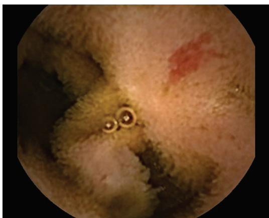
Figure 1. Angioectasia seen on Capsule Endoscopy.

A retrospective analysis of patients who underwent CE and enteroscopy at Mayo Clinic, Rochester, Minnesota, from September 2006 to June 2009 was performed. Study approval was obtained from the Mayo Clinic Institutional Review Board. The patients' electronic medical records, CE studies and endoscopic reports were reviewed. Clinical information, demographics, CE and enteroscopy data and images were