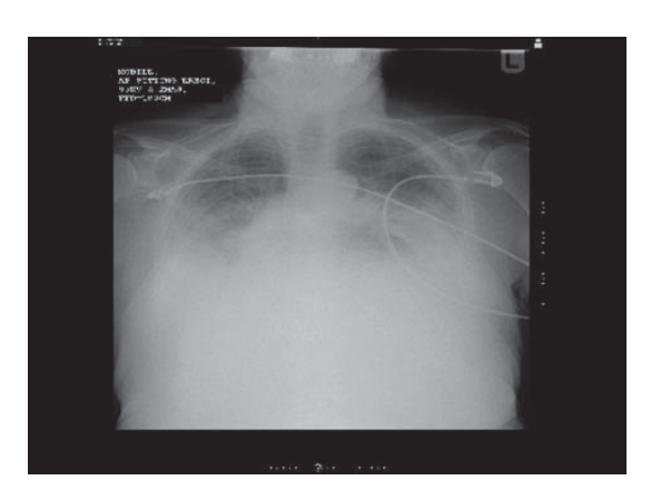
Figure 1. Chest X-ray taken on presentation to the Emergency Department. There is bilateral basal consolidation but no obvious hernia or pneumoperitoneum.

bendroflumethiazide), osteoporosis and previous appendicectomy. Alcohol intake was approximately seven units weekly and she was a non-smoker.