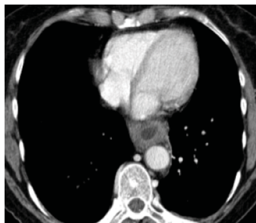
Figure 2. Circular thickness of the wall in the lower part of the esophagus and several augmented lymph nodes in the mediastinum and retroperitoneal.

histopathologic diagnosis of cancer. However, repeated endoscopic examinations did not lead to a final diagnosis of cancer. Literature shows a wider range of sensitivity (69% versus 100%) mainly depending on the experience of the endoscopists [4]. Therefore a CT of the chest with esophageal protocol was performed (We recommend a special protocol for the esophagus with double contrast. This protocol has been developed in the Radiological Department at the University of Heidelberg and is often performed with a precise benefit of information compared to a normal CT scan of the thorax. It is characterized by a distension of the wall of the esophagus due to the filling of the esophagus with water, which allows a better appraisal. Concurrently, the treatment with butylscopolamine is performed to eliminate the peristaltic, so with a modern spiral CT the appraisal of the whole esophagus can be enabled within only a few seconds. A reconstructed slice thickness of 4 mm is performed in a venous phase with a delay of 80 seconds.). This allows panoramic exploration, virtual endoluminal visualization, accurate longitudinal and axial evaluations and simultaneous evaluation of T and N parameters [5-8]. CT also provides a better presentation of the mucosa, and an appraisal of the