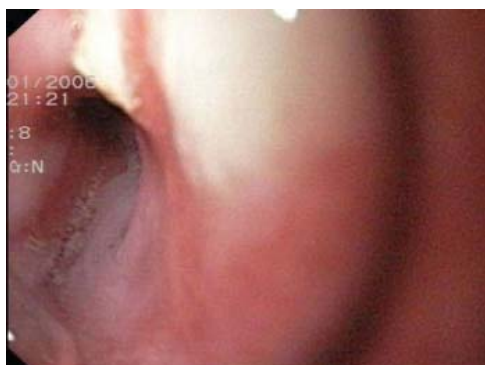
Figure 1. Esophageal ulcer.