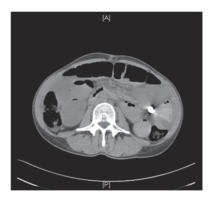
Figure 2. Abdominal CT demonstrating a retained capsule in the mid-portion of the jejunum.

Physical examination revealed normal vital signs including afebrile. Her jugular venous pressure and heart sounds were normal without S3, S4, rubs, or gallops. Abdomen was mildly tender with hypoactive bowel sounds without rebound tenderness or guarding. Neurologic examination revealed no focal deficits or nuchal rigidity. Laboratory evaluation revealed a white blood cell count of 4,900/μL (72%)