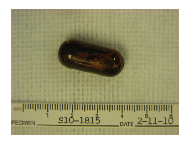
Figure 3. Photograph of retrieved capsule.

polymorphonuclear leukocytes), hemoglobin 12.5 g/dL, and platelets 186,000/\mu L . Complete metabolic panel revealed normal electrolytes, serum creatinine and liver function. Serum amylase and lipase were 40 U/L and 12 U/L, respectively. ESR was 12 mm/hr and TSH level was 1.15 mU/L.