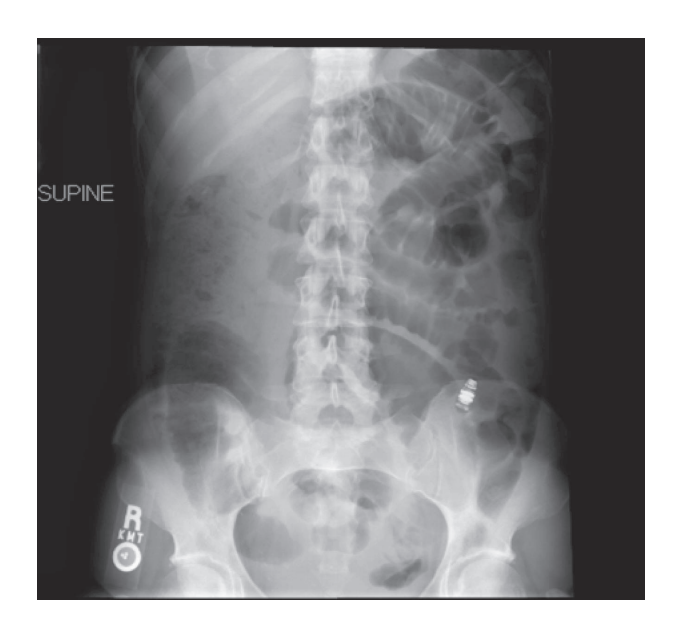
Figure 1. Abdominal radiograph showing a partial small bowel obstruction with retained capsule.

appetite but did have a 20-pound weight loss over the last three years.