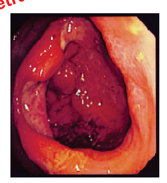
Figure 1. Ulceration in transverse colon noted 8 years after commencing Nicorandil.

ther "follow-up" colonoscopies at 2 yearly intervals. These were normal. A further colonoscopy 3 years later showed circumferential ulcer at the junction of the proximal and