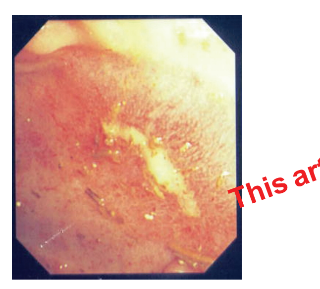
Figure 3. Healed ulcer 6 months after stopping Nicorandil.

middle third of transverse colon (Fig. 1). Histology showed non-specific inflammatory changes; there was no evidence of granulomata, dysplasia or neoplasia. Persistent ulceration was noted on 2 further colonoscopies at one year intervals (Fig. 2). Biopsies were benign on both the occasions. The ulceration was thought to be secondary to mucosal prolapse. At this stage after going through her detailed history it was noted that she suffered from ischemic heart disease and had been on nicorandil 30 mg twice a day for the last 13 years. After consultation with the cardiologist, Nicorandil was discontinued and dose of Isosorbide nitrate was increased. Further colonoscopy 6 months later showed healing of an ulcer (Fig. 3).