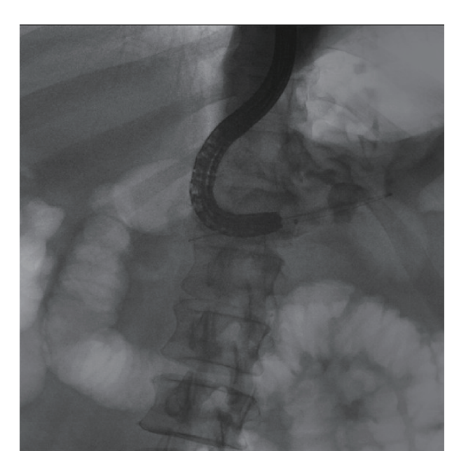
Figure 3. ERCP reveals the large pancreaticoduodenal fistula with contrast extravasation from the duodenum into the pancreatic duct.

IPMN of the pancreas are mucinous tumors that originate in the main PD, branch duct or both [2]. Based on histological characteristics, they are divided into low, intermediate, high grade dysplasia and invasive carcinoma [3, 4]. Frequency of incidental pancreatic cyst detection is on the rise secondary to the widespread use of imaging modalities which are done for other purposes [5]. Recent studies have described that IPMN are detected in 80% of patients with incidental pancreatic cysts