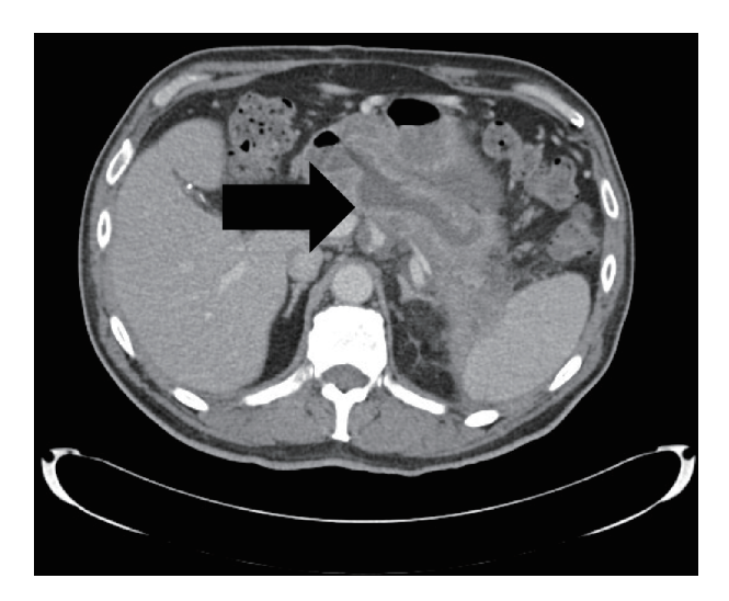
Figure 2. A sidebranch pancreatic duct within the pancreatic neck communicating with the first portion of the duodenum. It measures 1.6 cm in transverse diameter and represents a pancreaticoduodenal fistula.

scess which was communicating with the dilated main PD. He was treated with a 10-day course of ciprofloxacin and metronidazole. Patient was initially scheduled for distal or total pancreatectomy, but the surgery was delayed for 3 weeks to allow healing post hospitalization. Pre-operative computed tomography scan of the abdomen and pelvis with intravenous (IV) contrast demonstrated a pancreaticoduodenal fistula from the pancreatic neck to the first portion of the duodenum along with peri-pancreatic inflammatory changes and persistent ductal dilatation (Fig. 2). In the setting of the extensive adhesions between the pancreas, stomach and transverse mesocolon mesentery, the surgical procedure was aborted intraoperatively and will not be pursued further due to the high morbidity involved in attempting the pancreatic resection.